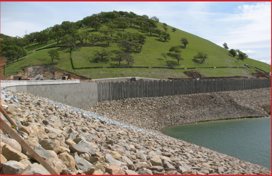
Los Vaqueros dam California, USA