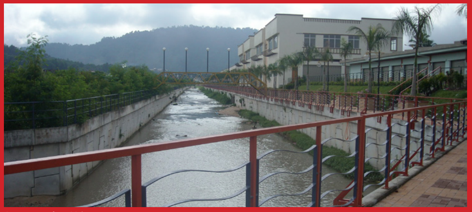
Ampang waterfront, Malaysia