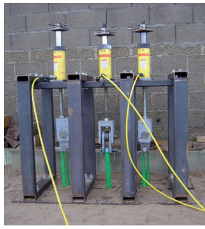
Strength testing the panels under the effect of the tensile load of reinforcements