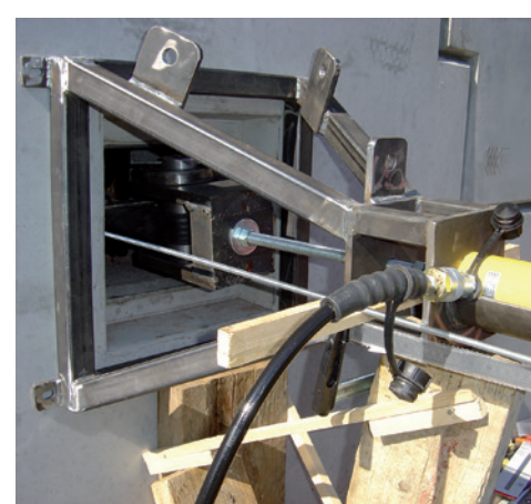
In situ extraction tests