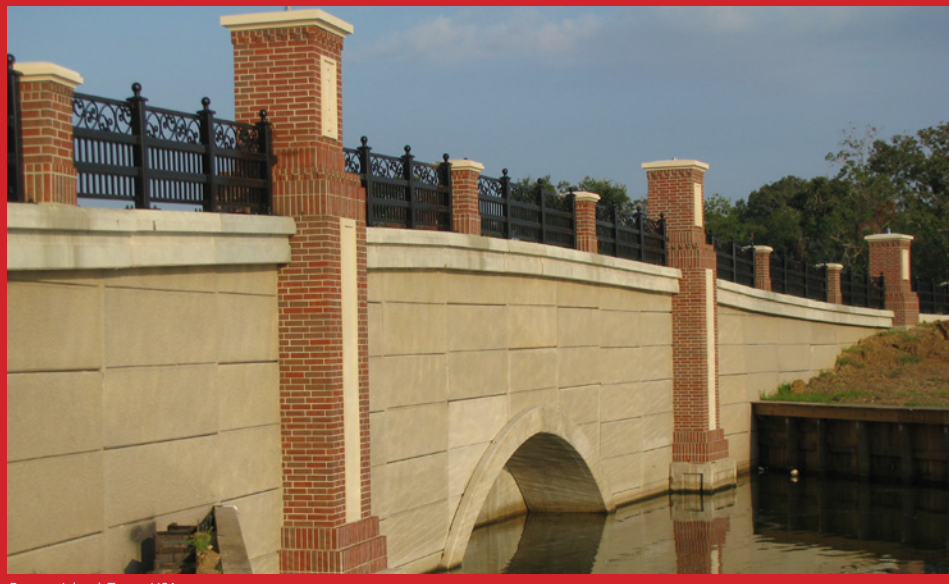
Beacon Island, Texas, USA