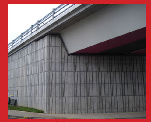
Access ramp to the London 2012 Olympic games site, United Kingdom